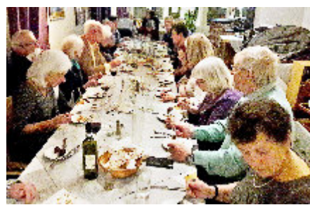
Annual Dinner January 2020

REMINDER: Subscriptions Due £4 Per household