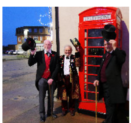
The Recently Renovated Phone Box In Coalville outside Hermitage FM Radio Station will provide free calls to services

It is a great pity that this symbol of friendship between the two towns has been removed.