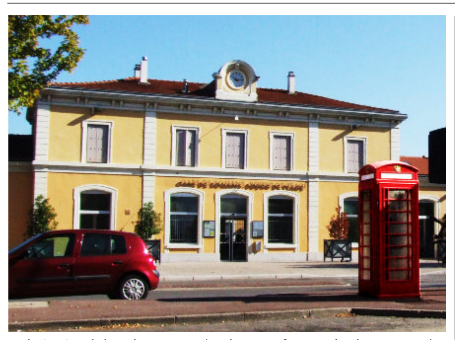
The iconic red phone box presented to the town of Romans has been removed